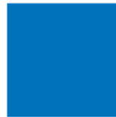
PANTONE 300 C C 99 M 50 Y 0 K 0 R 0 G 113 B 187

When Gotham is not available for internal and office materials, Arial should be used.