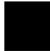
BLACK C 0 M 0 Y 0 K 100 R 0 G 0 B 0