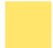
PMS 121 C C 0 M 8 Y 70 K 0 R 255 G 227 B 106