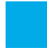
PANTONE 299 C C 86 M 8 Y 0 K 0 R 0 G 169 B 231